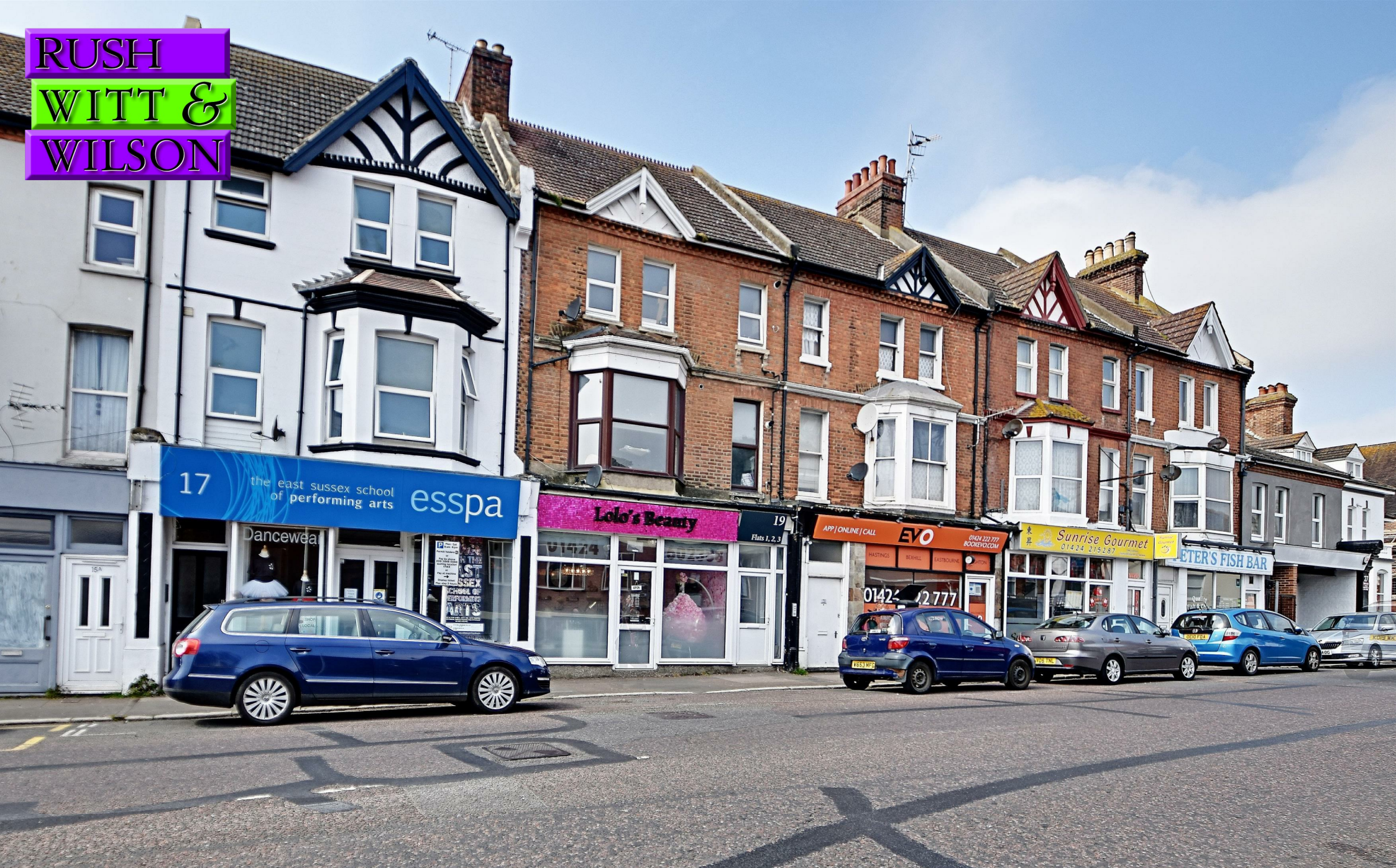
Flat 1, 19 London Road, Bexhill-On-Sea, East Sussex TN39 3JR £189,950